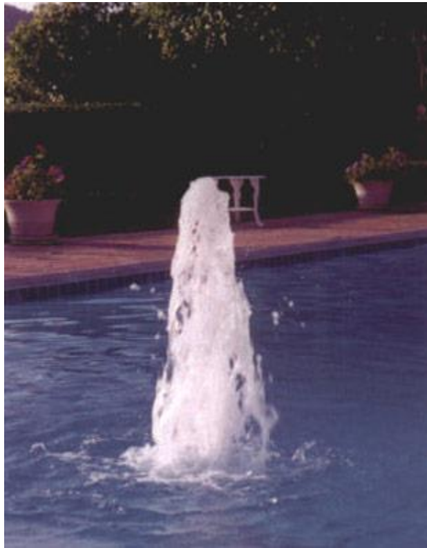
Cascading Head Fountain Model TFC

Our Cascading Head Fountain is a single spout of water that rises about 2 feet. The size and amount of water movement can be adjusted with the gate valve. Also you can special order the head placed nearer the surface of the water which will give you a higher, narrower spout of water. Any modifications must be specially ordered. The fountain head retracts flat to the bottom of the pool when not in use.