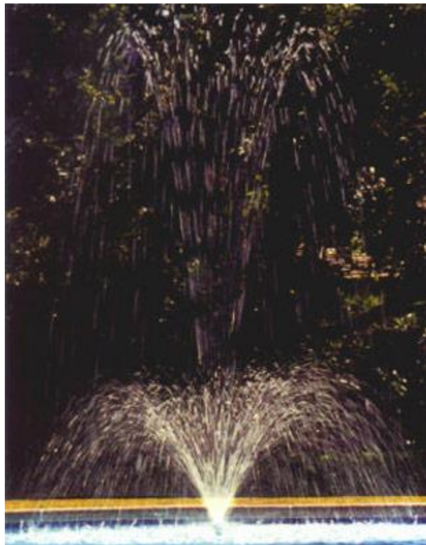
Shower Of Diamonds Model TF

If you are considering adding a pool or pond water fountain to your pond, pool or spa, you have come to the right place. Aquascope specializes in pool and pond water fountain products to add to the enjoyment of your pond, pool or spa.